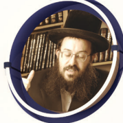
הרה"ר שלמה אפל שליטי"א הלכות טהרה