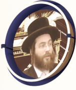
הרה"ר ניסוי פאלאנק שליטי"א הלכות שבת